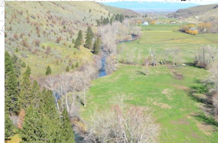
Catherine Creek on Southern Cross Acquisition Property Viewing Downstream